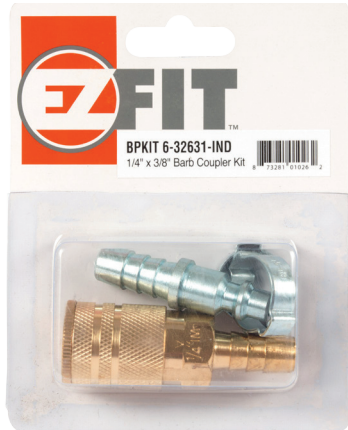
BP Accessory Kit #6