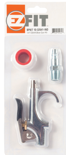
BP Accessory Kit #10