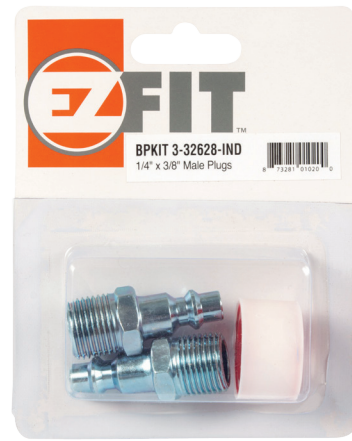
BP Accessory Kit #3