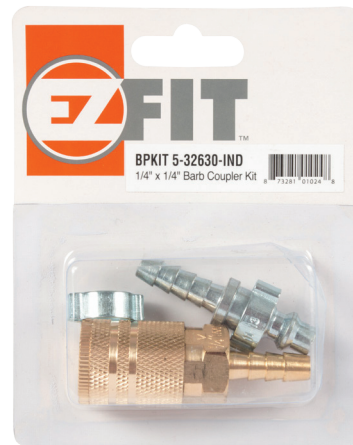
BP Accessory Kit #5