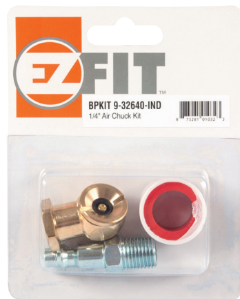
BP Accessory Kit #9