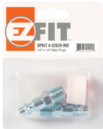
BP Accessory Kit #4