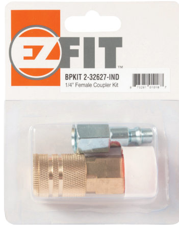
BP Accessory Kit #2