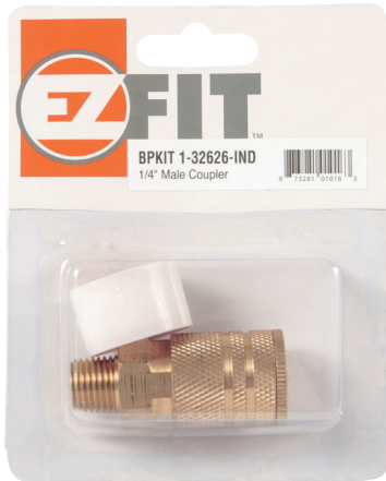
BP Accessory Kit #1