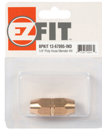
BP Accessory Kit #13