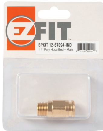
BP Accessory Kit #12