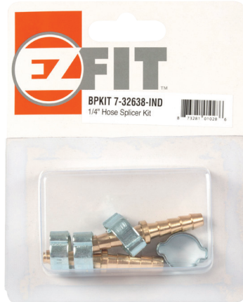
BP Accessory Kit #7