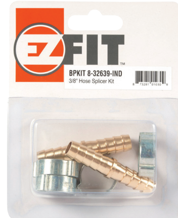
BP Accessory Kit #8