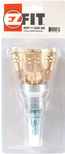
BP Accessory Kit #11